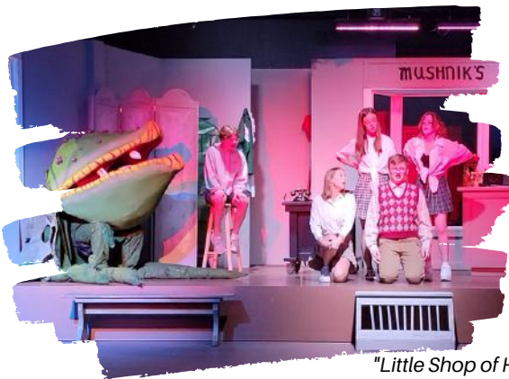
"Little Shop of Horrors" Summer '22

Study the process of auditioning to build a repertoire for future auditions. Students will practice monologues, song choices, and dance combinations in this course.