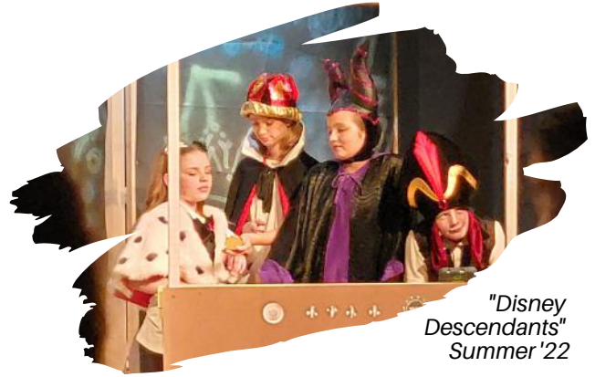
"Disney Descendants" Summer '22

Explore core principles of acting, voice, movement, objectives, obstacles, theatre vocabulary, and the importance of risk-taking and ensemble building.