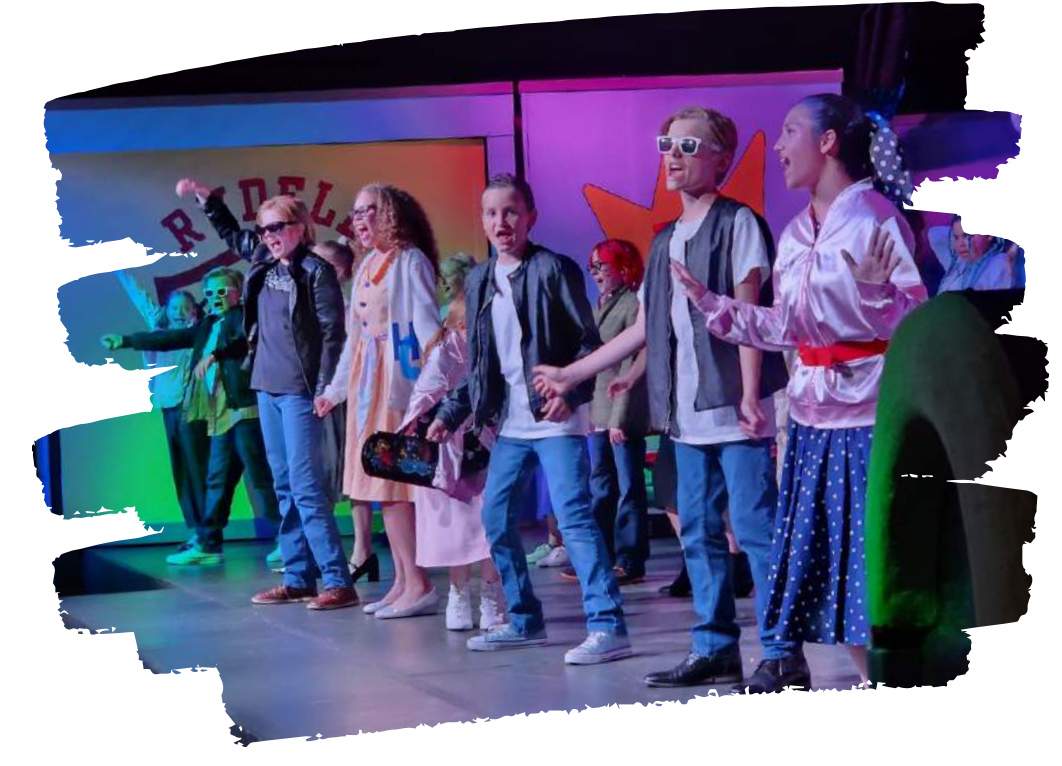
"Grease: School Edition"" Summer '23

Stay tuned for more information about our Winter and Spring 2025 Sessions!