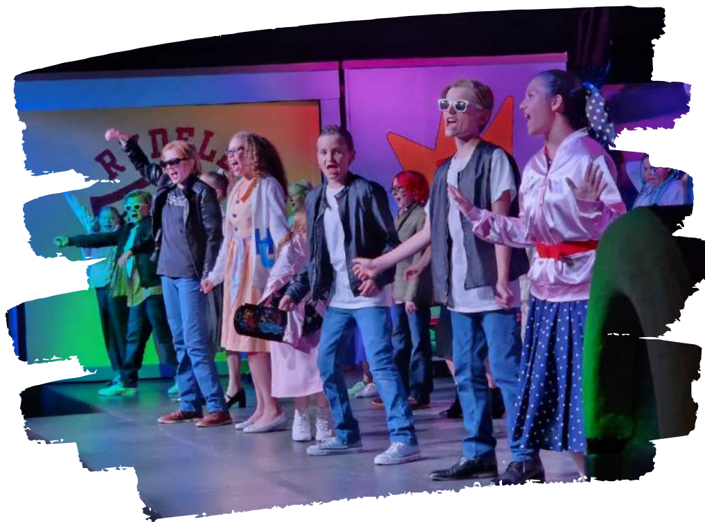
"Grease: School Edition" Summer '23