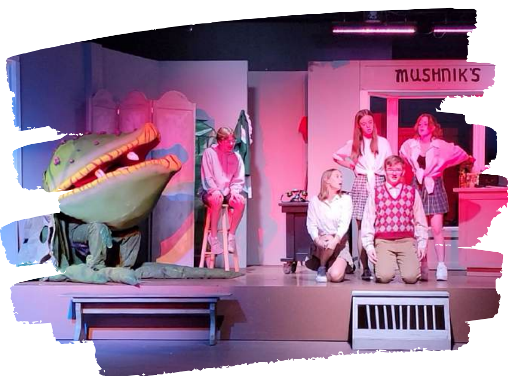
"Little Shop of Horrors" Summer '22

Study the process of auditioning to build a repertoire for future auditions. Students will practice monologues, song choices, and dance combinations in this course.