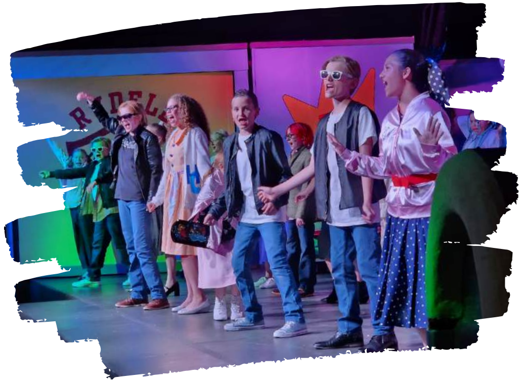
"Grease: School Edition" Summer '23