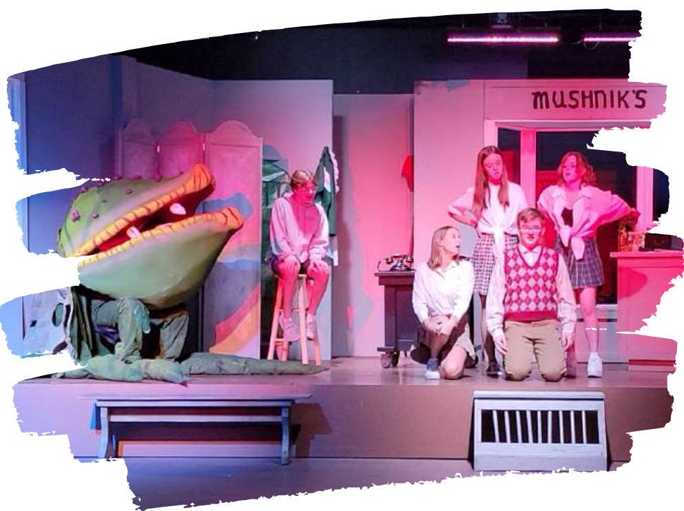
"Little Shop of Horrors" Summer '22

Study the process of auditioning to build a repertoire for future auditions. Students will practice monologues, song choices, and dance combinations in this course.